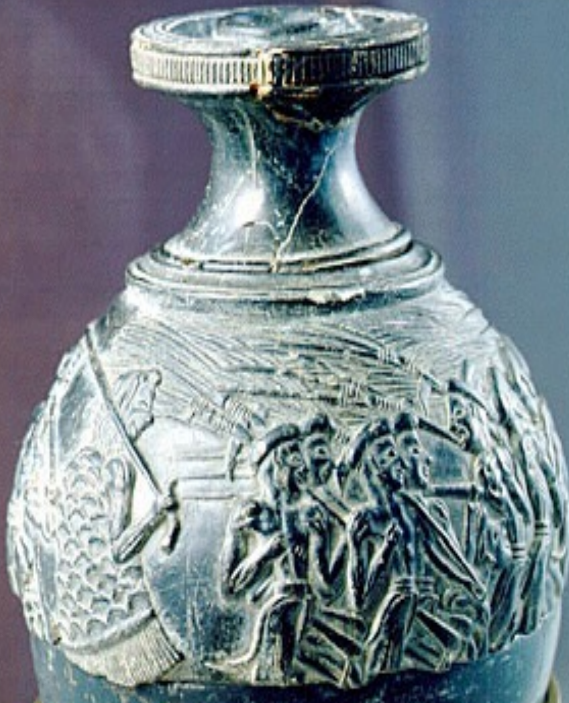
Upper Part of the Harvester Vase, from Hagia Triada, Crete (c. 1650-1450) BCE Minoan