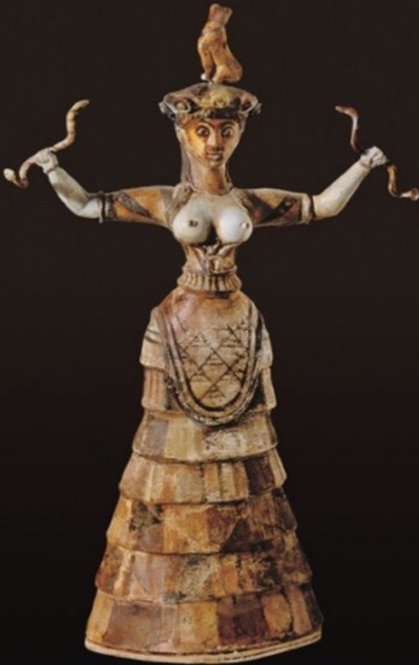
Snake Goddess, from Knossos, Crete c. 1600 BCE Minoan