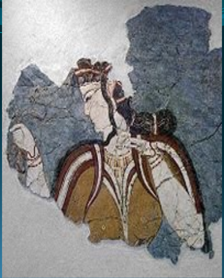
Goddess from the Citadel of Mycenae, (c. 1200 BCE) Mycenaean