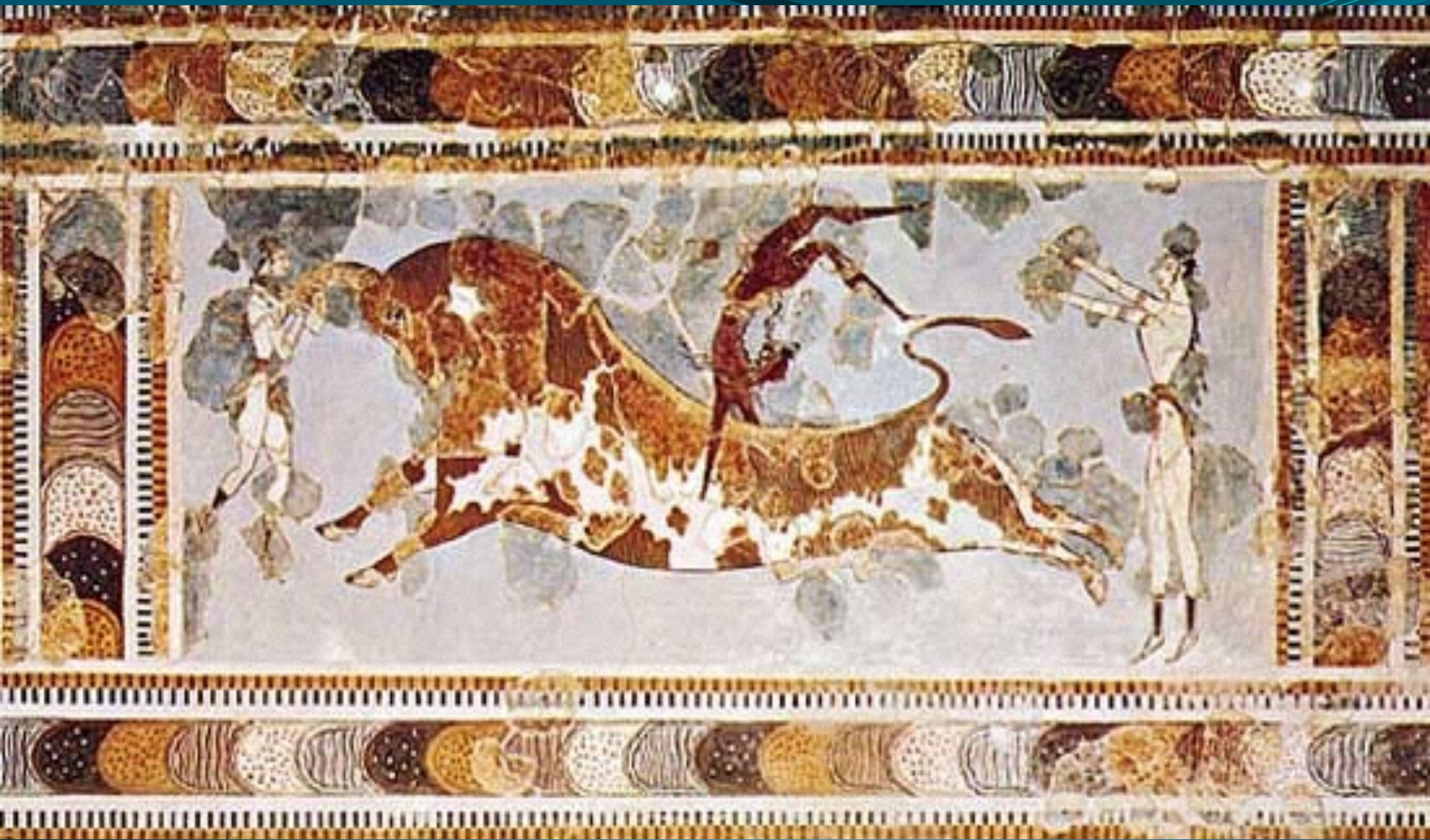
Toreador Fresco, from Knossos, Crete. (c. 1500 BCE) Minoan Civilization