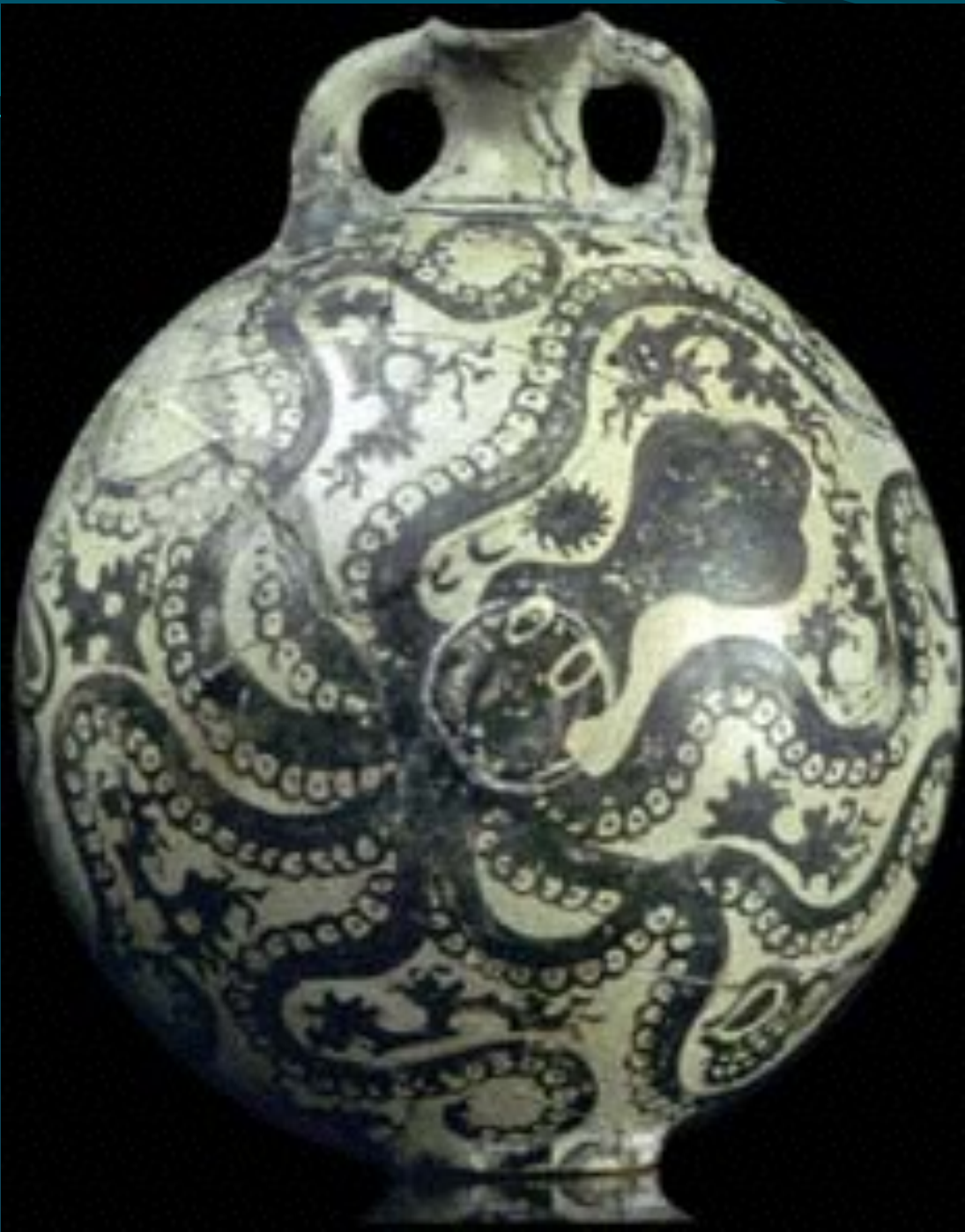
Octopus Vase, from Palaikastro, Crete, (c. 1500) BCE Minoan