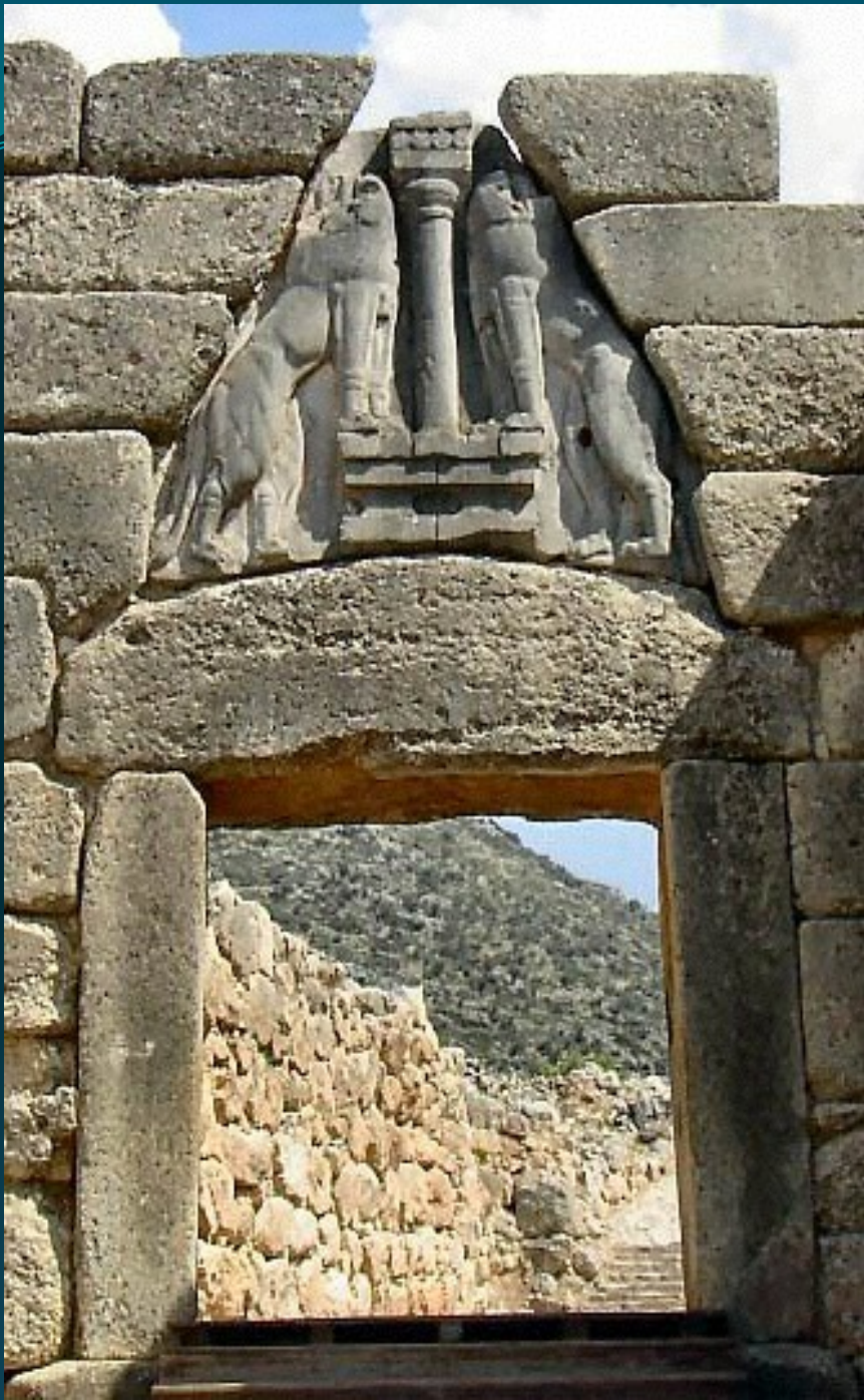
Lion Gate, Mycenae 1300 BCE, Mycenae