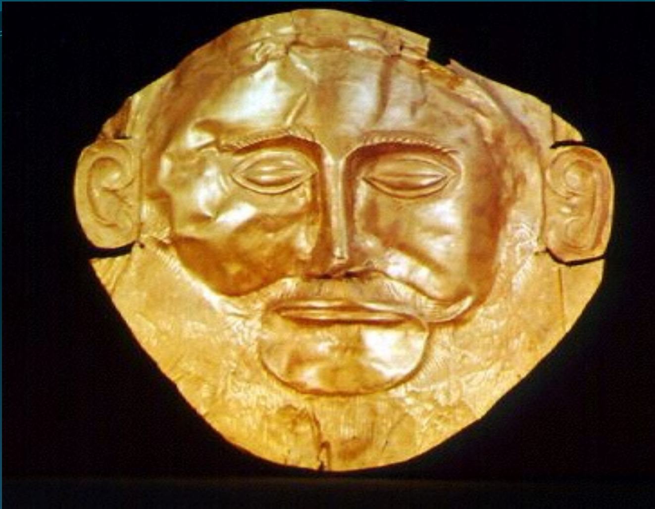
Mask of Agamemnon, from Mycenaean c. 1500 BCE, Mycenaean