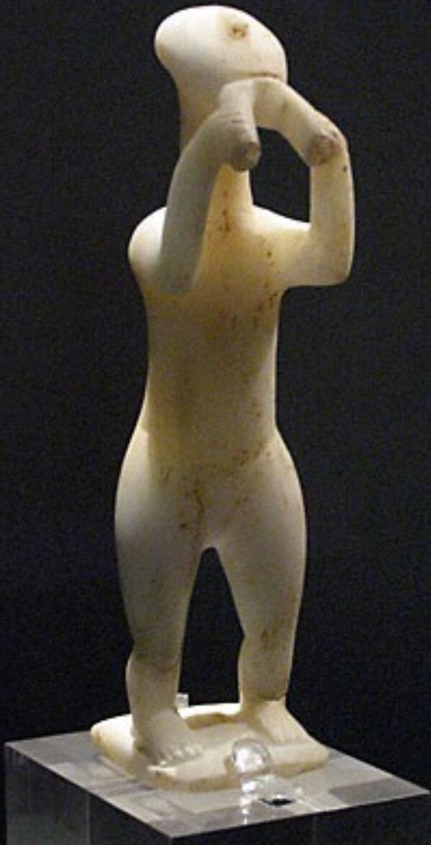
Male Cycladic flute player from Keros c.2700-2300 BCE Early Bronze Age