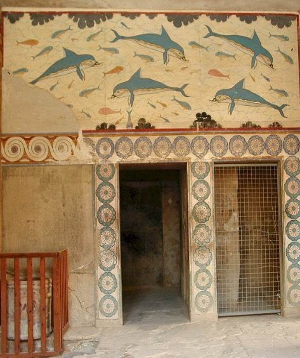
The Queen's megaron , Palace of Minos, Knossos, Crete, c. 1600-1400BCE Minoan period