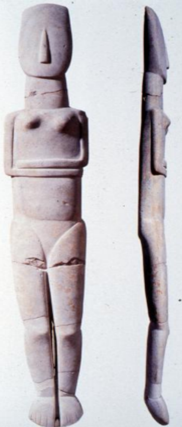
Female Cycladic Idol, from Amorgos c.2700-2300 BCE Early Bronze Age