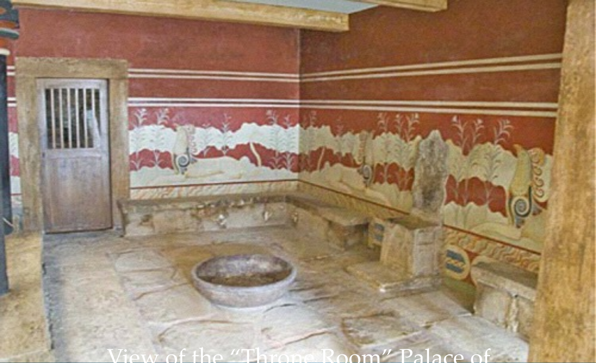
View of the “Throne Room” Palace of Minos, Knossos, Crete (c.1600-1400 BCE) Minoan