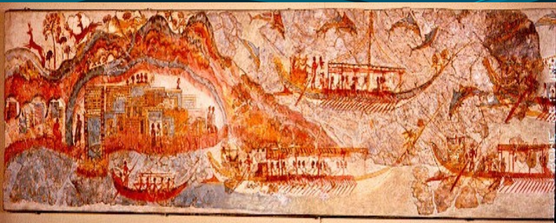
Ship Fresco, from Akrotiri, Thera, (c. 1500-1650) BCE Theran