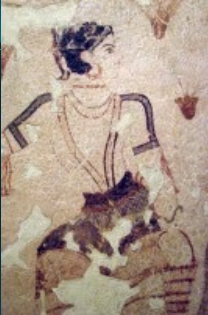
Crocus Gatherer, from Thera, Pre 1500 BCE Theran